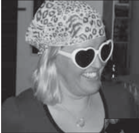
Top: Entrants in the Crazy Hat Competition prepare to state their claim on the prize.