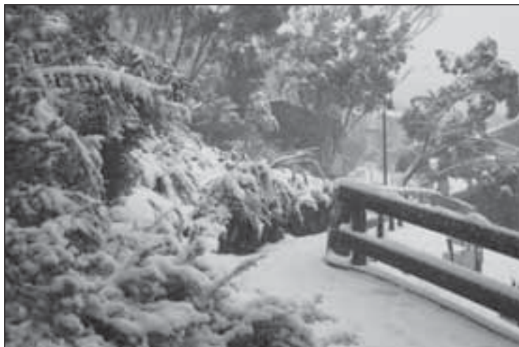
A snowy August scene at Thredbo