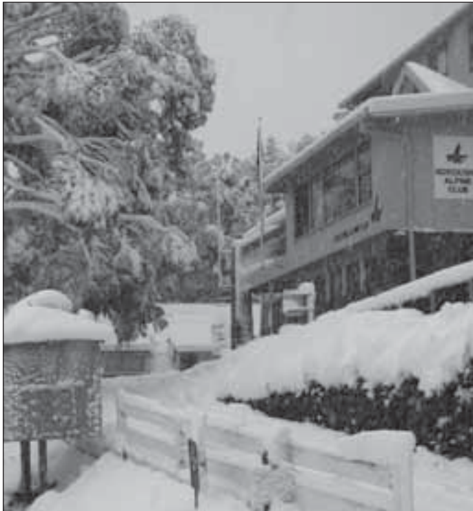
KAC Thredbo in the depths of winter

OFFICIAL JOURNAL OF THE KOSCIUSKO ALPINE CLUB